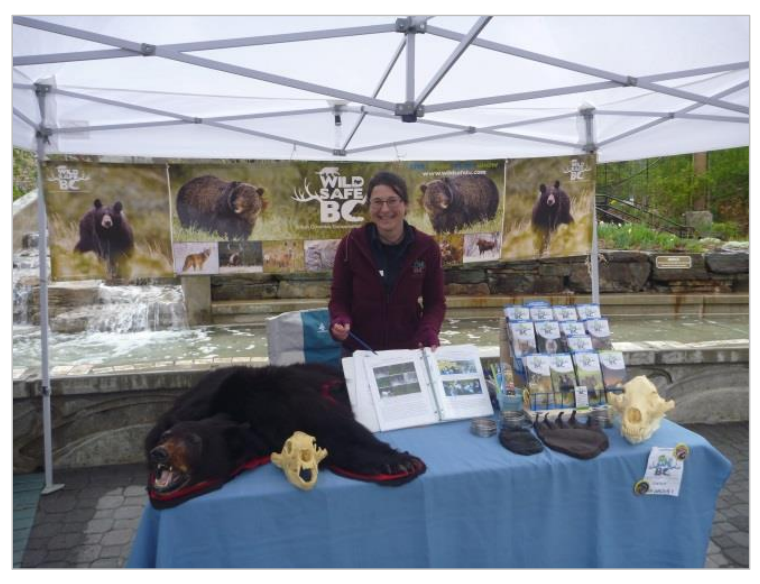
Figure 4. Display booth at Famers' Market (May 2019).