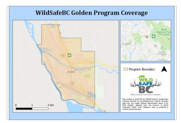
Figure 1. WildSafeBC Golden program coverage area.

In terms of wildlife activity, there are generally two peaks observed in reporting bears: one in the spring, when bears come out of hibernation and one in the fall as they prepare to enter hibernation. Garbage remained the most reported attractant, followed by fruit trees. This valuable knowledge helped guide the WCC as to when and where to focus their educational efforts. Together with its community members, the WSBC Golden program works at keeping wildlife wild and communities safe.