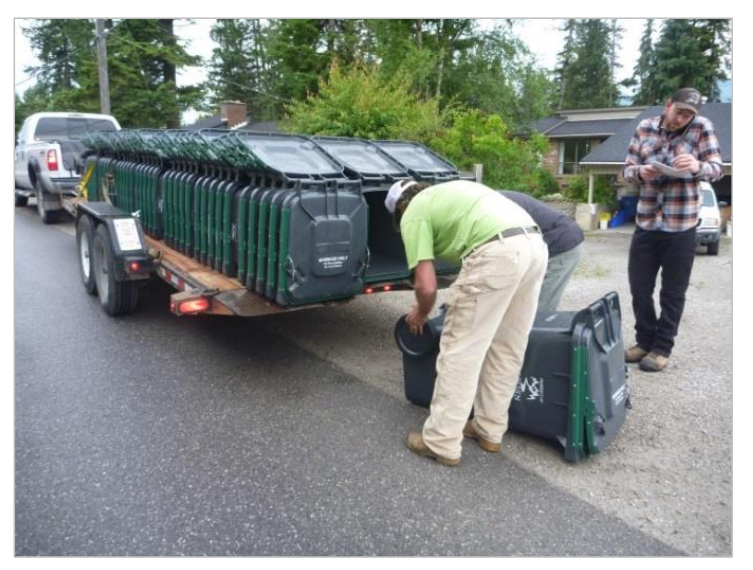
Figure 8. WildSafeBC Golden assists with the third and final deployment of bear-resistant bins (July 2019).

This was the third and final deployment. With their working partner VP Waste Solutions Ltd, the Town of Golden has distributed approximately 1,500 bear-resistant bins since 2017 (approximately 400 in 2017, 460 in 2018, and 650 in 2019). Residents are encouraged to take steps to ensure bears do not have access to residential garbage.