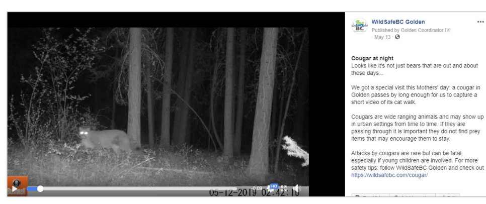
Figure 5 Example of a popular Facebook post using recent wildlife trail camera footage of a local cougar.