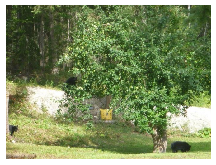
Figure 7. Local black bear sow with two cubs in a residential apple tree.

WildSafeBC Golden plays a role in connecting local volunteers with local fruit tree owners and those interested in using the fruit. Domestic fruit is an unnatural source of high calorie food at a time when bears are preparing for winter hibernation. Bears will often teach their offspring where to find these food sources which can lead to repeated conflicts (Figure 7. Local black bear sow with two cubs in a residential apple tree. It is important to keep bears away from these unnatural food sources by picking fruit early before it is fully ripened. The WSBC Golden Facebook page is instrumental in bringing together community efforts to reduce attractants by using educational posts and by connecting fruit-picking volunteers with fruit-tree owners and with those interested in picked fruits (e.g. horse and pig owners).