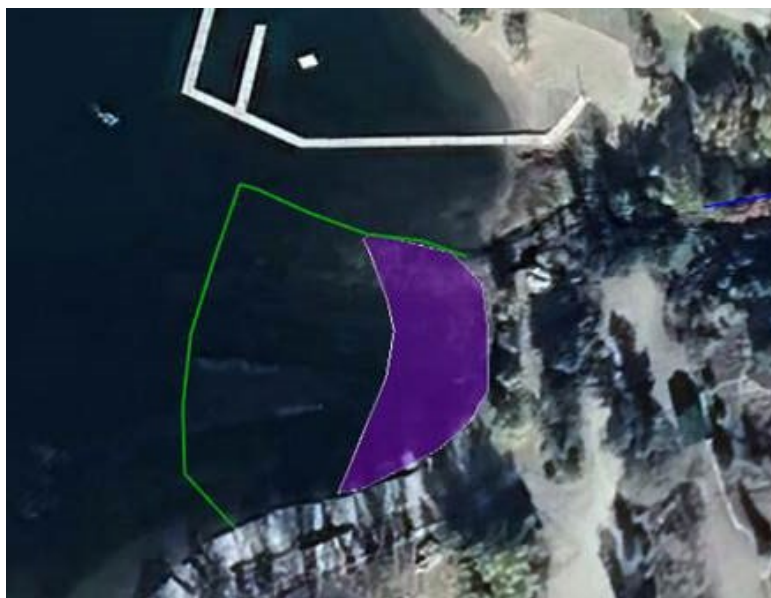
Figure 3. Isolated area (green outline) and dredged area (purple polygon).