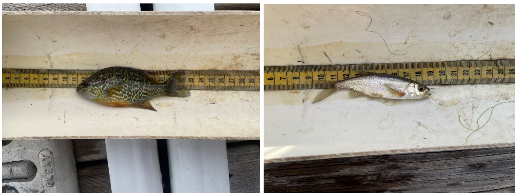
Figure 5. Pumpkinseed and Peamouth Chub salvaged at the Timber Ridge marina, respectively.