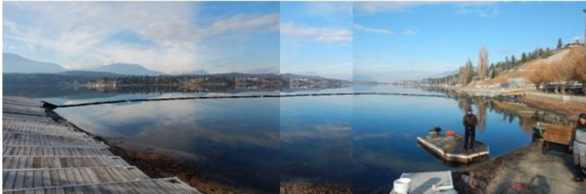
Figure 2. Silt curtain isolating marina.

A silt curtain was set up to isolate the marina on November 3, 2021 (Figure 2). The EM salvaged fish from within the isolated marina area. The salvage involved the following techniques: electrofishing and setting baited hoop and minnow traps. Electrofishing was only conducted when water temperatures were above 5°C, from November 3 - 5. The traps were retrieved and reset daily from November 4 - 10, and then retrieved and reset every few days, with the maximum set period being 71.5 hours. Captured fish were held in a bucket of lake water and were identified to species. Fork lengths and weights were also measured. The fish were released outside of the isolation area, where there was connectivity with the larger lake body (Figure 3). Further salvaging efforts were completed on February 22 and 23, 2022, prior to dredging. A total of nine baited minnow traps were set at the back end of the marina in the isolated area that was not planned to be dredged (where depths were greater than 1.0 m).