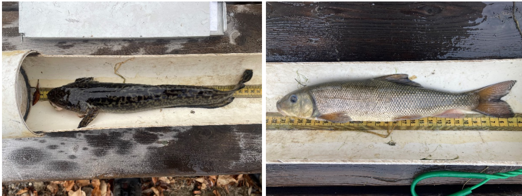
Figure 6. Burbot and Largemouth Sucker salvaged at the Timber Ridge marina, respectively.